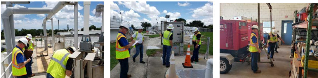
Images of annual safety audit at sewer plant.

The Sewer Department Jacobs completed 272 work orders and nine sewer inspections. Jacobs' annual safety audit was performed this week by an off-site regional support staff at the plant. A walk-through inspection of the plant was conducted.