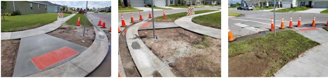
Images of sidewalk and curbing on Potenza Drive.

The Public Works Streets and Drainage Department is in the process of restoring the affected area of the 8-inch water main break that occurred last week on Potenza Drive. The sidewalk and curb line that needed to be removed to make the repair have been replaced, and sod installed.