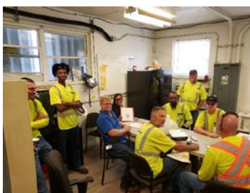
Image of employees during training.

On Wednesday, I attended a ‘Help and Support’ training session for personal and work-life matters that was presented by Jacobs at the plant. This training, conducted by Jacobs’ personnel, was an in-house training session for their employees regarding how to reach out for help, what some signs are, and that help is available through the Employee Assistance Program.