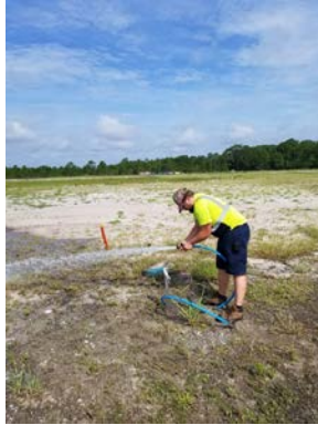
Image of City employee repairing water service leak.