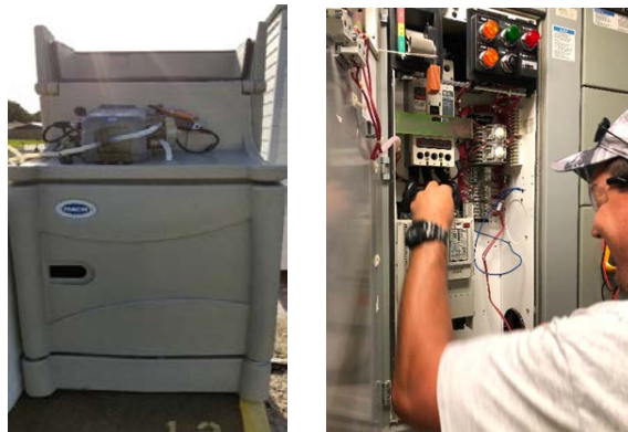
Images of controller and installation at sewer plant.

The #3 deep well injection pump soft start controller and the flume effluent auto composter was replaced this week due to a lightning strike that impacted the plant back in May 2019.