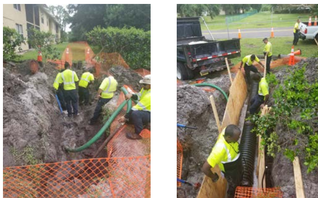
Images of City employees working on drainage pipe.

The Public Works Streets and Drainage Department is working on a drainage pipe located at the on Greenboro Drive. This drainage pipe runs north and south from Greenboro Drive, to the canal on the north side of the apartments. The pipe is being prepared for this year's CIP of lining storm drain pipes. A new 20-foot section of ADS pipe had to be installed in order to replace the original section of pipe. The pipe failed as the result of tree roots infiltrating the pipe and restricting the water flow.