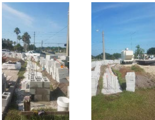
Images of VMC lift station and wall construction.

Jacobs's staff has been monitoring the installation of the new block wall construction that is being erected around the Veterans Memorial Complex lift station site and odor control system.