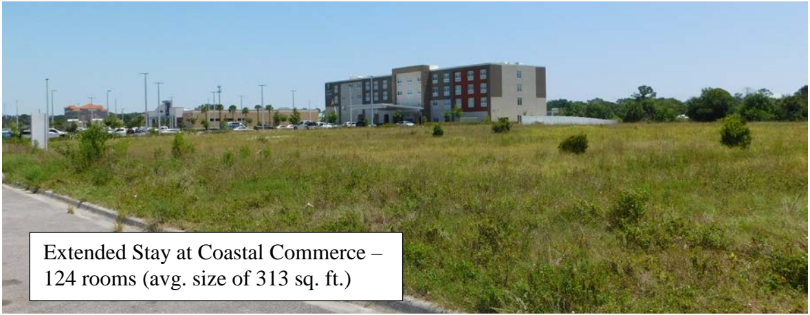
Extended Stay at Coastal Commerce – 124 rooms (avg. size of 313 sq. ft.)