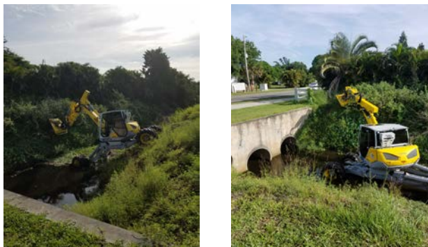
Images of Menzi Muck cleaning C1-E canal.

The Public Works Streets and Drainage Department continued clearing the C1-E canal, located behind Hollywood Estates, with the Menzi Muck. Maintenance started this week from Hollywood Boulevard and continued east to where the utility line runs across and midway through the canal.