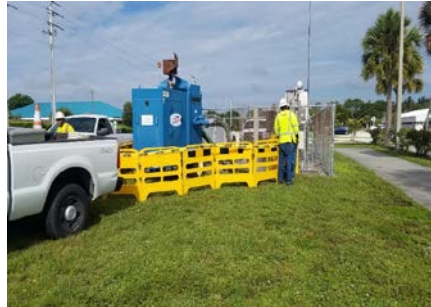
Image of Meadowlane lift station.

The Sewer Department Jacobs completed 158 work orders and 19 sewer inspections, and inspected Cypress Landing and Woodfield Suites job-site locations for their 2-year sewer maintenance bond. They received two CIP spare pumps at the plant, one for the reuse distribution system and one for the reuse transfer pump. They also set up the standby by-pass pump at the Meadowlane lift station for the control panel replacement as part of this year's CIP. This control panel is the last of three to be installed and will complete this project.