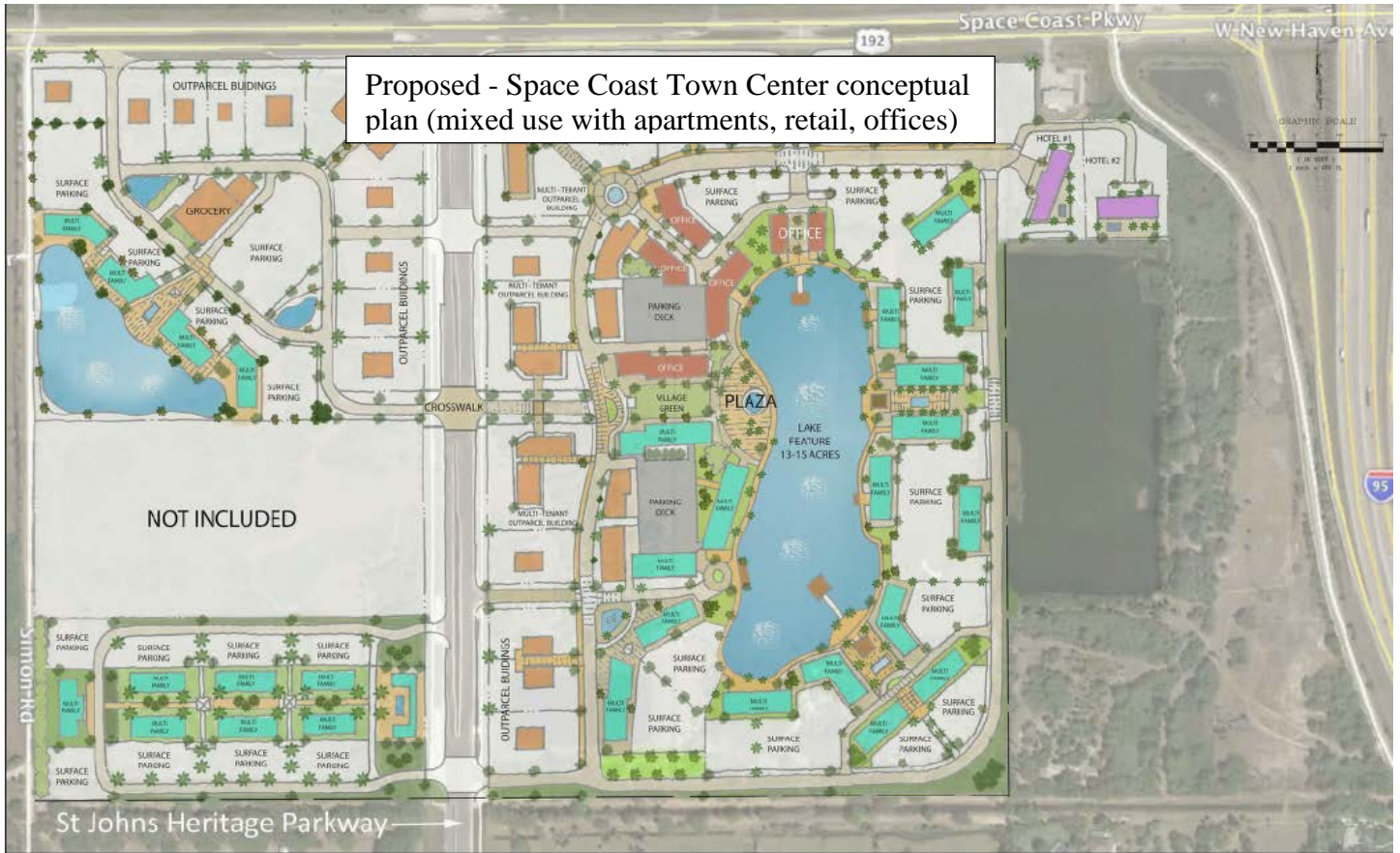
Proposed - Space Coast Town Center conceptual plan (mixed use with apartments, retail, offices)