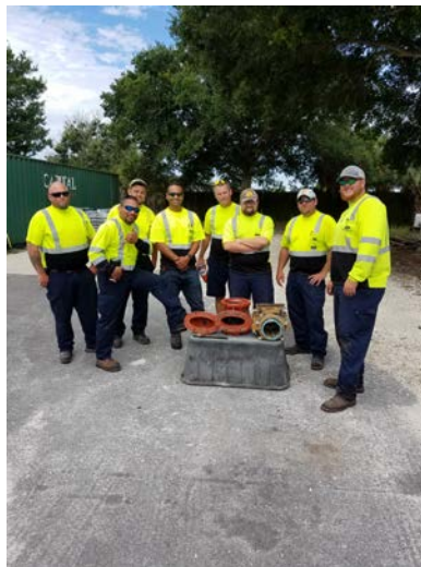
Image of City employees at valve education class.