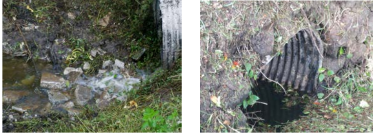
Images of intake and outfall of storm drain pipes.

The Public Works Streets and Drainage Department have been preparing for this year's CIP of storm drain pipe lining. The City's contractor, Insituform Technologies, will be starting this project at the end of this month. Public Works employees have been cleaning the intake and outfalls of the storm drain pipes that are scheduled to be lined.