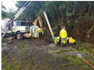
Images of City employees assisting with force main break.

The Public Works Streets and Drainage Department continues with clearing the C1-E canal, located behind Hollywood Estates, with the Menzi Muck. This canal is the City's largest canal that starts at Doherty Drive and Henry Avenue, and runs east to Dairy Road where it enters into Melbourne.