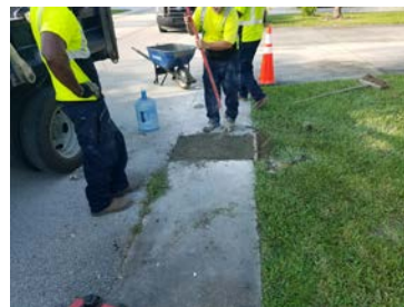
Images of City employees repairing sidewalk in Hollywood Estates.