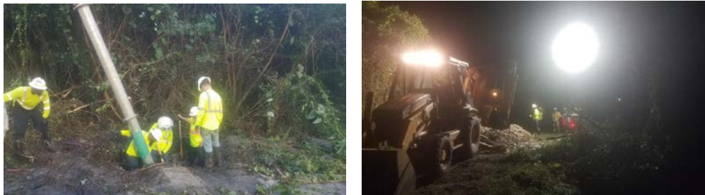
Images of Jacobs employees repairing force main.

The Sewer Department Jacobs responded to the Garrett's Run force main break located on Greenboro Drive where a section of the 10-inch force main split. Jacobs employees cut out the affected piece of force main pipe, and installed a new section. Within hours, the force main was back in service. No customers were affected during this repair.