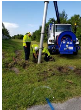
Image of City employees verifying pipe location.

The Public Works Water Department completed 155 work orders this past week. They serviced and painted 10 fire hydrants, along with exercising two water valves. They also completed three fire flow tests and performed a mock shut down on the water main on Greenboro Drive for an upcoming water/stormwater project. The crew spot dug a six-inch water main and a four-inch water main to verify the pipe size and location, with the assistance of the Public Works Vac-Con.