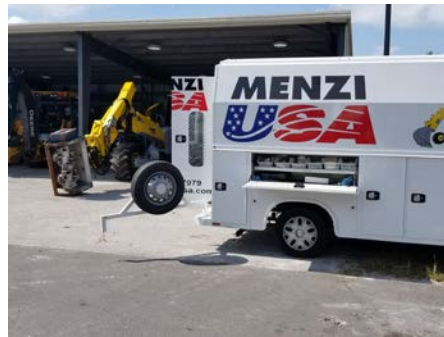
Image of Menzi Muck being maintained.

The Public Works Streets and Drainage Department's Menzi Muck received its first scheduled maintenance service at 100 hours, per warranty. The Menzi reached 100 hours of operating time in the City canals, and is receiving this service to ensure the Menzi is operating at peak capacity.