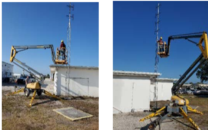
Images of contractor repairing the telemetry antennae at the sewer plant.

Data Flow System was onsite at the plant to troubleshoot the antennae input/output signal that was transmitting under capacity. After their inspection, water was discovered in the wire connections and the cause of the low signal. The connections were cleaned and secured, and the system signal is now operating at 100%.