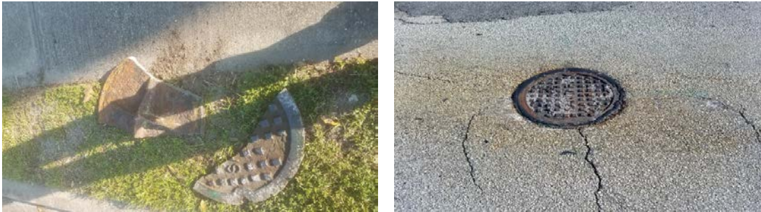
Images of broken and replaced manhole cover on U.S. 192.