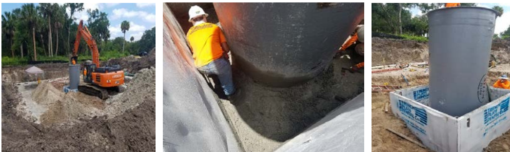
Images of wet well being installed at the Springs of Hibiscus lift station.

They observed the installation of the Springs of Hibiscus lift station wet well being installed at the new development site by Don Luchetti Construction.