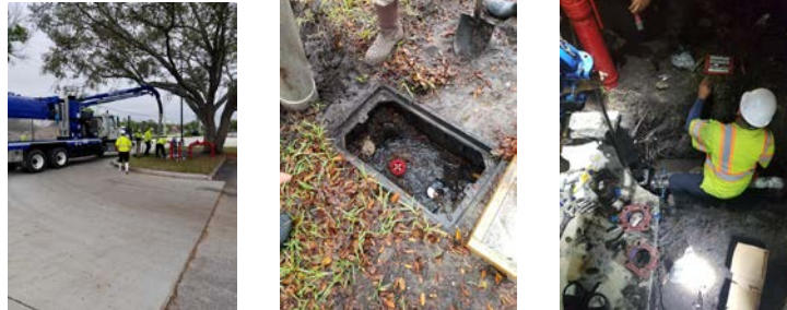
Images of water line repair on W. New Haven Avenue.

The Water Department responded and repaired a 3-inch water service leak at 2125 W. New Haven Avenue which resulted in a Precautionary Boil Notice to be issued to four commercial buildings. This PBWN was rescinded after bacteriological samples were taken at the location showing the water was safe to drink.