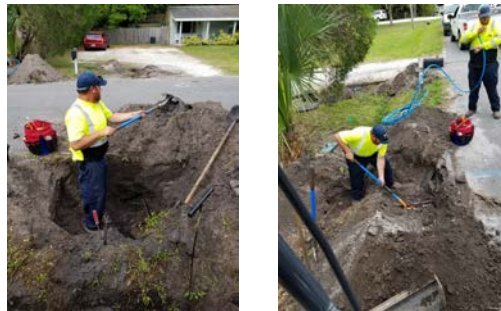
Images of water line installation on Shannon Avenue.

They also installed a new water service line at 99 N.W. Shannon Avenue due to low water pressure. The old line was replaced with a new poly service line.