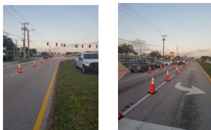
Images of Maintenance of Traffic pattern to assist workers.

The Public Works Streets and Drainage Department assisted Jacobs with an inspection of a City sewer manhole located on U.S. 192 and Bossieux Boulevard in the east bound/left lane. Public Works set up a Maintenance of Traffic (MOT) sign pattern to allow Jacobs employees to make a quick and safe assessment of the condition of the manhole.