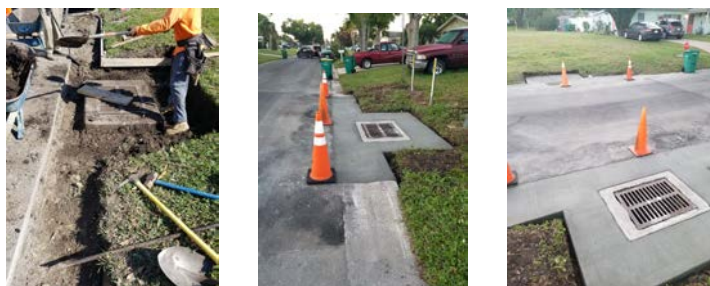
Images of new curbing installation on Monaco Road.

The Public Works Streets and Drainage Department worked with Atlantic Foundation and Concrete Repair by installing a new section of curb line on Monaco Road. Monaco Road was recently repaved with a full depth reclamation along with the installation of new curbing around and leading up to the stormwater grates. This new section of curbing will aid in the flow of stormwater into the existing drainage structures.