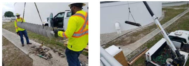
Images of grit cyclone augur/screw installation at sewer plant.