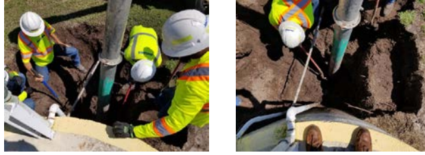
Images of crew repairing a reuse pipe leak at the plant.

Repairs were also made at the plant after detecting a leak on the reuse piping.