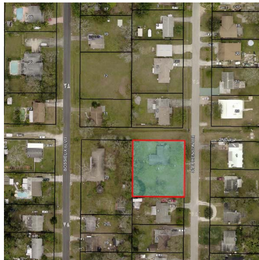
Aerial photo of a portion of Melbourne Estates with 205 Stephenson Drive outlined in red and shaded in aqua.

At the City Council meeting on December 18, 2018, a neighbor requested that the City purchase the Property, which is low-lying and flood-prone, to use for a stormwater retention project to reduce flood risks in the Melbourne Estates neighborhood (Stephenson Drive and Bossieux Boulevard). The City's project engineer, ISS, evaluated the Property and determined that it is viable for a stormwater retention project. The Property is on an oversized lot (0.48 acres), and adjoins the "paper roadway" identified as Second Avenue on the plat of Melbourne Estates.